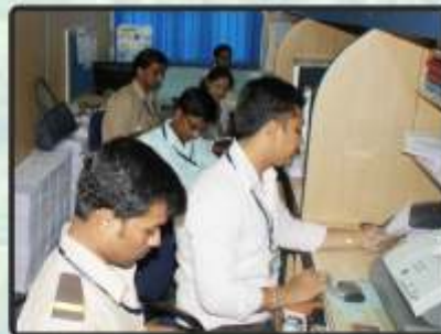
Information Technology Department