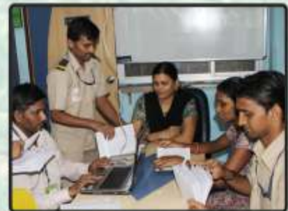
Library & Conference Room