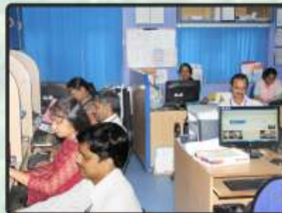
Publicity & Publication Department