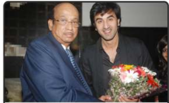
Mr. Ranbir Kapoor, Noted Actor