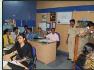
Human Resource & Administration