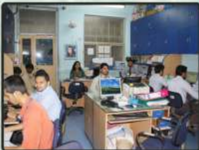
Accounts & Finance Department