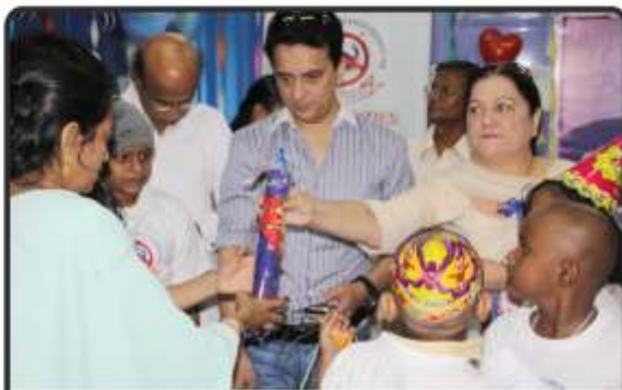
Mr. Sajid Nadiadwala, Noted Film Maker