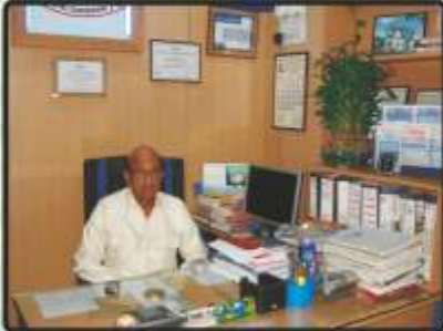
Chairman in his Cabin