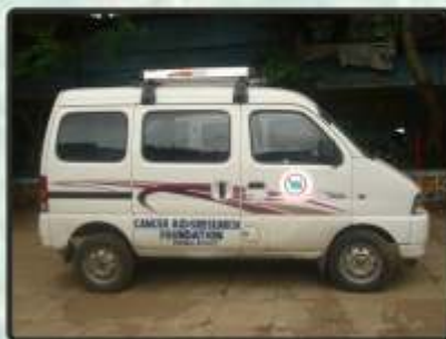
Cancer Film Screening Vehicle