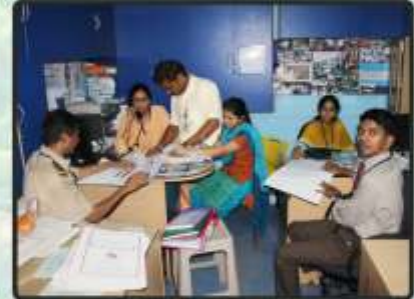
Patient Services Department