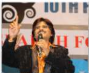
10th Foundation Day